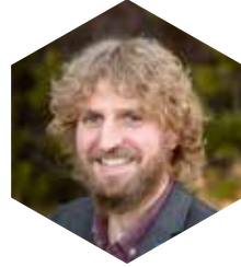
Devin Middlebrook Mayor