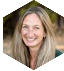
Cristi Creegan Mayor Pro Tem